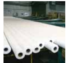
Insul-8 ® _rev021